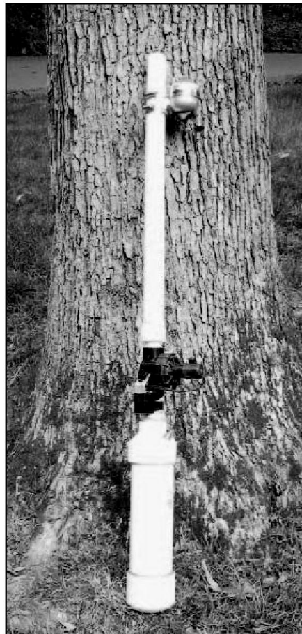
Figure 1 — The assembled antenna launcher ready to be pumped up and used.

This last factor is important since my club, the Vienna Wireless Society of Vienna Virginia, normally has our field events in public parks with many people around. This launcher attracts a friendly curiosity such as “what is that thing ?” and usually generates a few “wows” and “cools” when it launches. How can you be afraid of something you pump up with a regular tire pump (see Figure 2)? Everything, including the pump and a few accessories can easily be carried in a medium size sports bag as shown