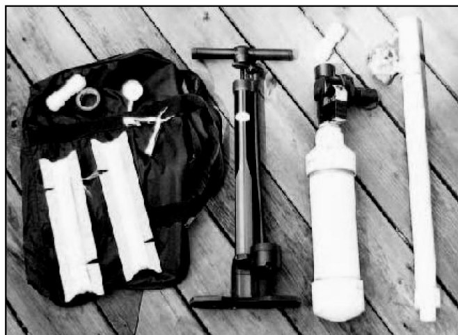
Figure 2 (left) — How can bystanders be afraid of something you pump up with a regular tire pump?

The firing trigger consists of two 9 V batteries, a safety switch and the firing button. All are wired in series and mounted to a 1 x 4 inch aluminum plate. The entire assembly (9) is then taped to the sprinkler valve. Although not shown in the figures, I would recommend that the aluminum plate be about 6 inches long and bent back above the fir-