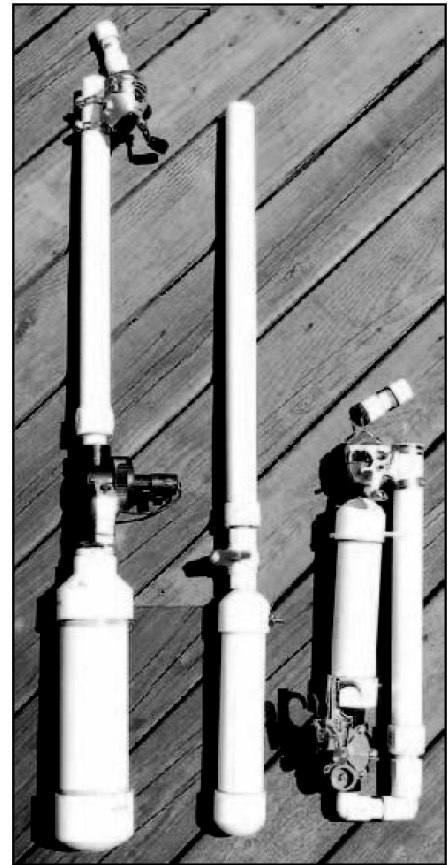
Figure 7 — Other types of valves and firing systems can be used. Right: Firing the sprinkler valve pneumatically. Center: a PVC globe valve.

Do not screw the barrel tightly into the valve; it is not necessary, nor is Teflon tape required. When you are in position and ready to fire, push the release on the fishing reel and only then drop the projectile into the barrel. Turn the safety switch to ON and fire. I find that after a shot it is easier to reel in the line or