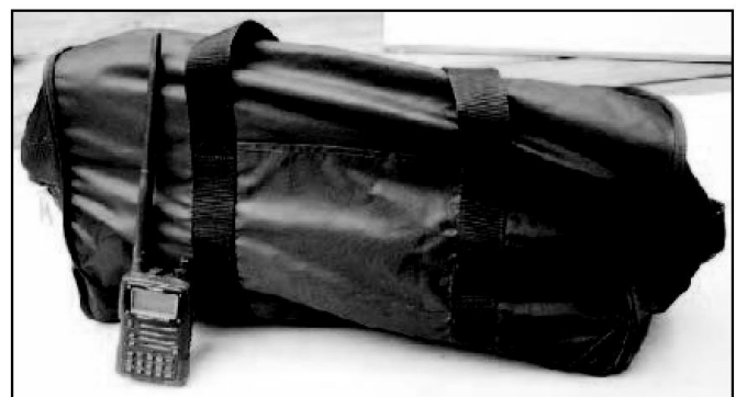
Figure 3 — All the pieces can conveniently fit in a medium size sports bag.