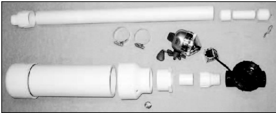
Figure 4 — The spudgun is easy to fabricate from the pieces shown.

ing button to reduce the chance of accidental firing.